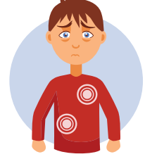
BODY ACHES Fatigue, weakness