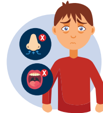
LOSS OF TASTE OR SMELL